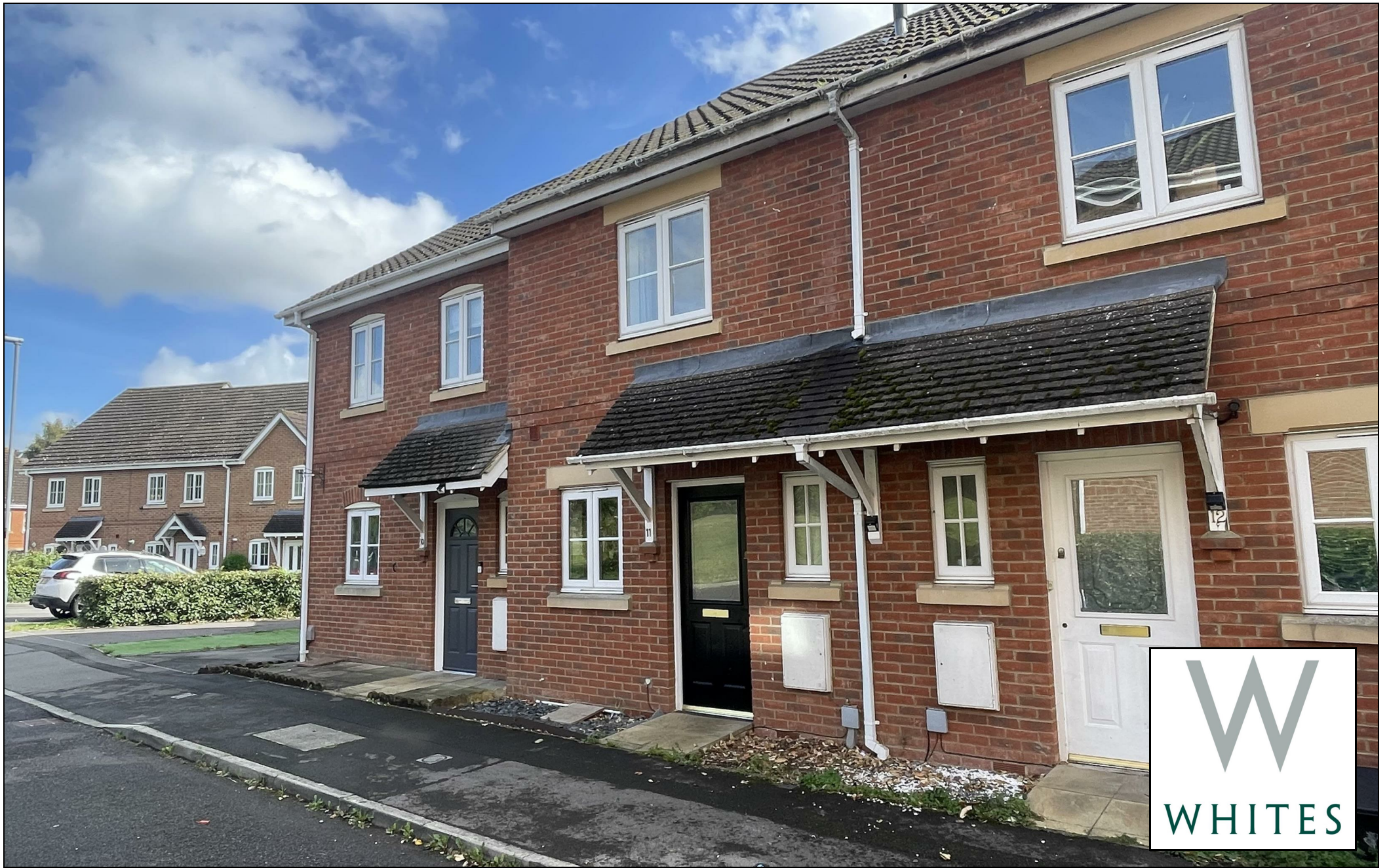
11 Old Dairy Close, Salisbury, Wiltshire, SP2 9HG